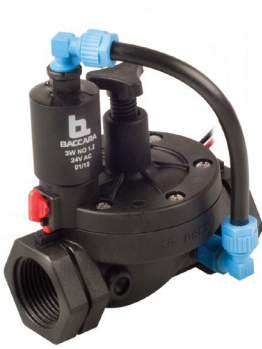
Upstream pilot control