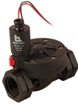
External pilot control