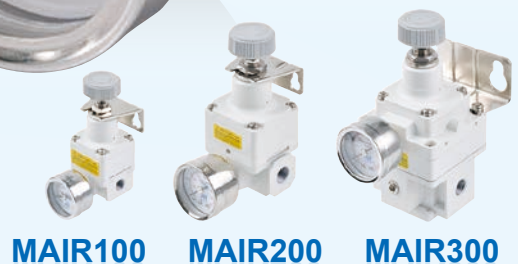
MAIR100 MAIR200 MAIR300