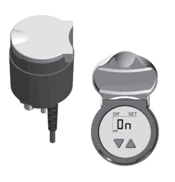
Baccara Ltd. Kvutzat Geva, 1891500, Israel www.baccara-geva.com